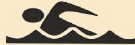
Swimming Pool with Separate Pool for Kids