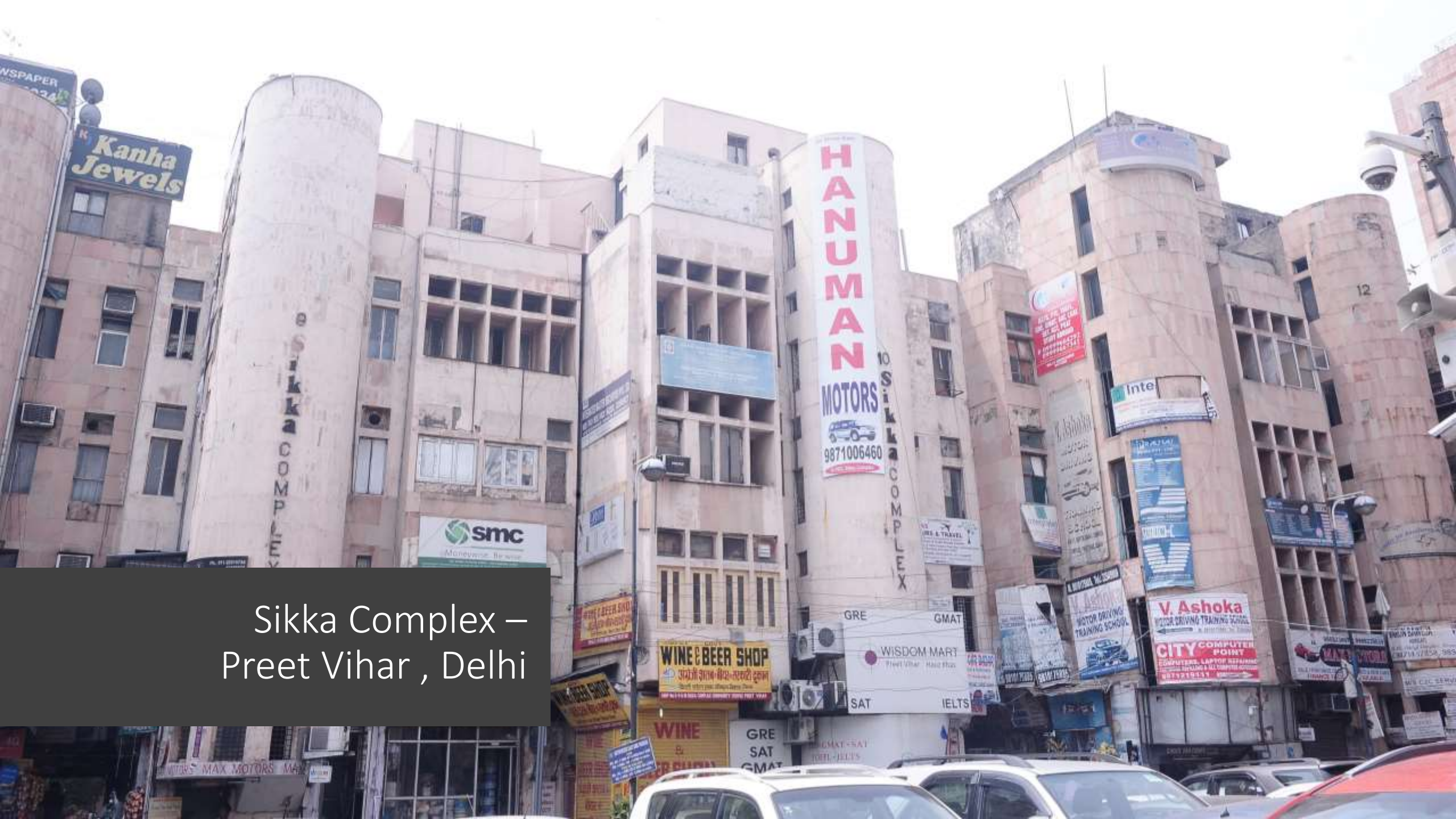
Sikka Complex – Preet Vihar , Delhi