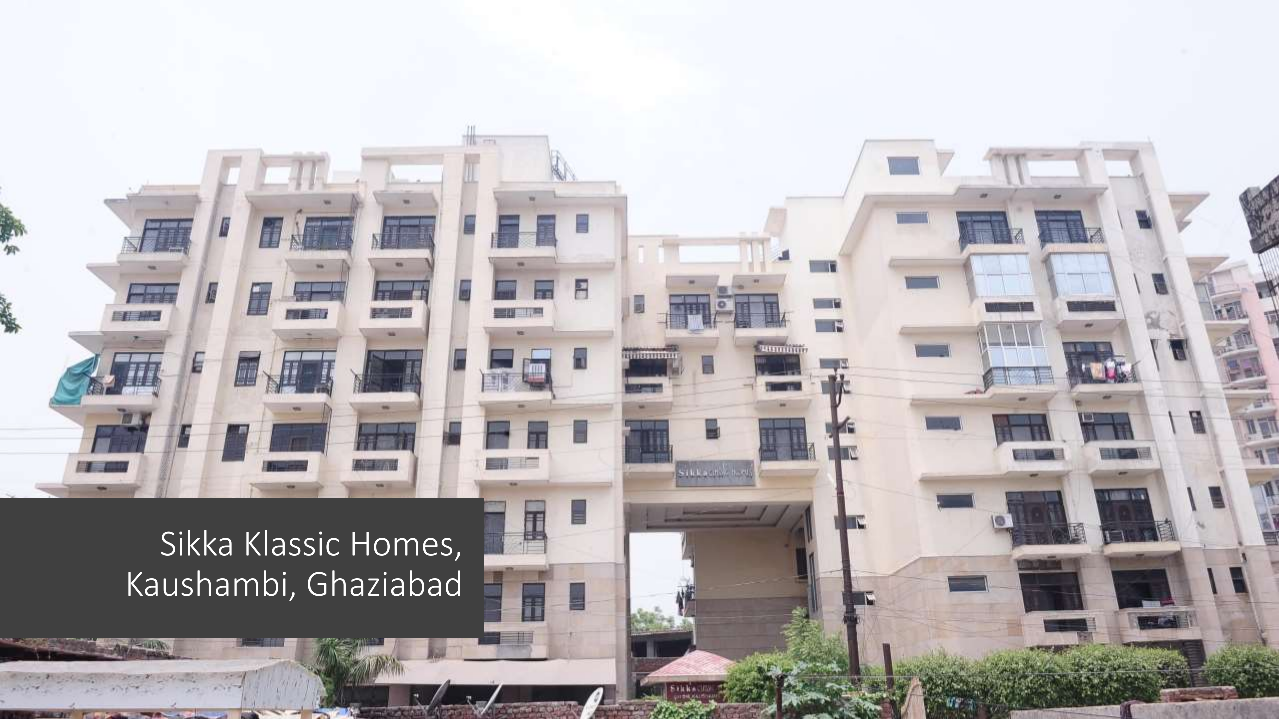
Sikka Classic Homes, Kaushambi, Ghaziabad