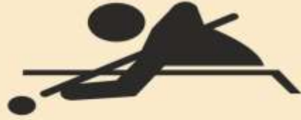
Fully Equipped Club with Billiards/Snooker