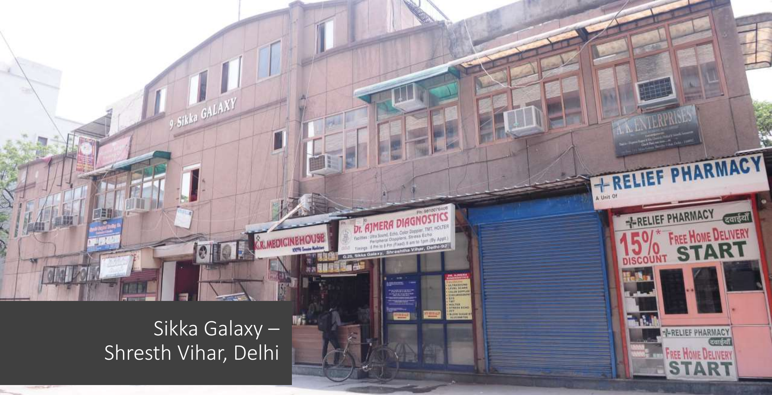
Sikka Galaxy – Shreshth Vihar, Delhi