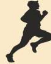
Walking & Jogging Track