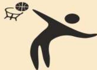
Half Basketball Court