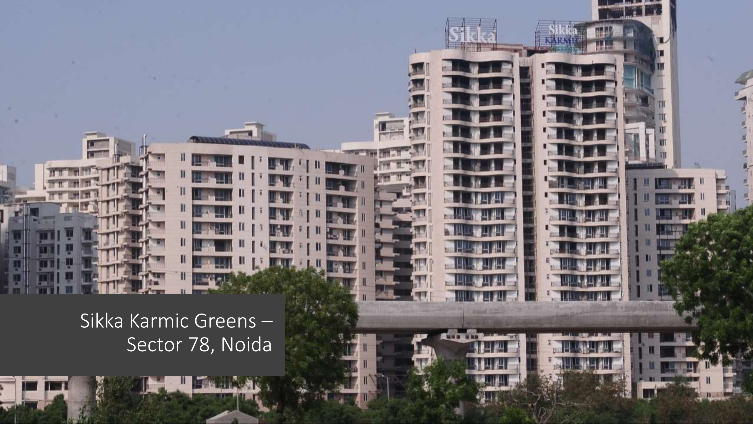
Sikka Karmic Greens – Sector 78, Noida