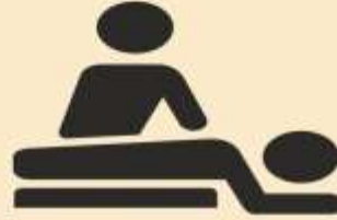
Jacuzzi & Aroma Massage Therapy Spa