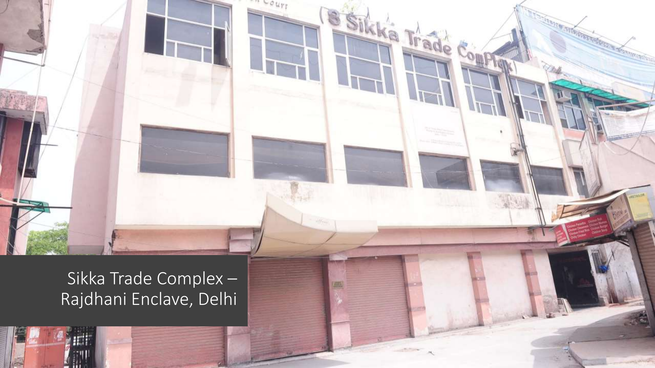
Sikka Trade Complex – Rajdhani Enclave, Delhi