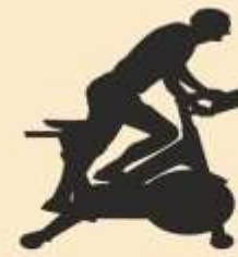
World Class Gymnasium